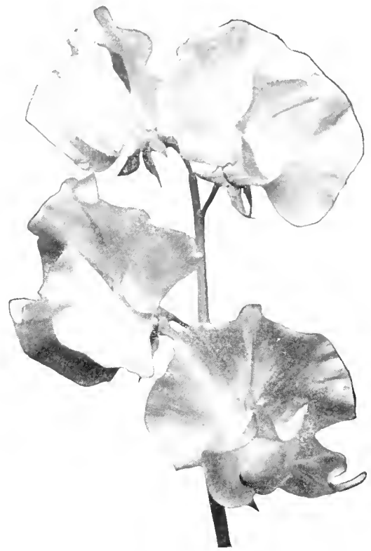
Giant Rose—1/3 Natural Size